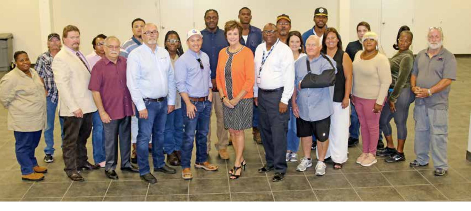
Southeast Texas Chapter's Construction Site Carpentry Program, facilitated by Lamar State College-Pt. Arthur. The class, which feeds its graduates into local industrial construction jobs, is offered at no cost to students.

The chapter hosted an inaugural Casino Cruise on Lake Austin in early June. Another sell-out, this event was a great way for chapter members to network and have fun playing casino games and winning prizes. The members all said they look forward to this again next year.