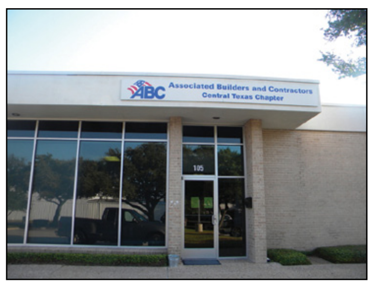
The new Central Texas Chapter facility, which opened August 1st, is 4600 square feet, with office space, three training rooms and a shop area. The Chapter is a training facility for UT Arlington and conducts all the upper level OSHA classes and other safety classes.

The program has been developed by area company safety professionals – subject matter experts who are part of TEXO's