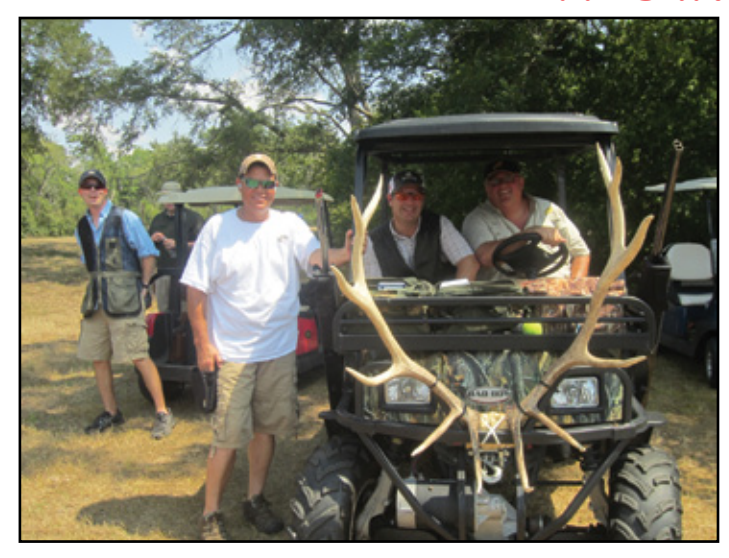
The ABC Greater Houston Chapter held a successful Fall PAC Clay Shoot to raise funds for the upcoming elections. Over 200 shooters enjoyed a beautiful day of clay shooting followed by a Bar-be-que lunch.

The Chapter also hosted a Golf Tournament on September 19th and are planning an EIC Banquet on October 10th. There are 30 entries this year for the Excellence in Construction Awards and 19 Safety application were turned in for the Chapter Safety awards. All the winning project will be listed in a special supplement in the Austin Business Journal which will be distributed in November.