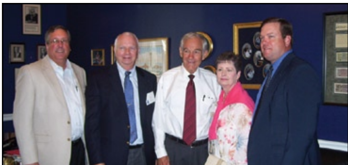
Members from the ABC Greater Houston Chapter visit with Congressman Ron Paul

order to give our members a chance to discuss important issues with their elected representatives. ABC's voice has been heard loud and clear on issues such as immigration, taxes, licensing, tort reform, workers compensation and other factors that impact our industry. It is an exciting time of year in the world of politics and members of ABC North Texas refuse to sit on the sideline and hope the right team wins. Our members are in the game and are committed to making the difference in the final score.