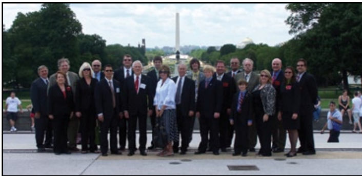
Members from the ABC South Texas Chapter visit legislative representatives in Washington, D.C.