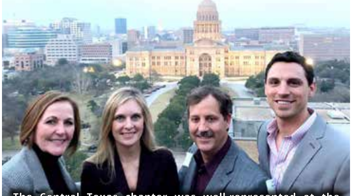
The Central Texas chapter was well-represented at the ABC of Texas Legislative Day events February 5th and 6th.

The chapter was well-represented at the ABC of Texas