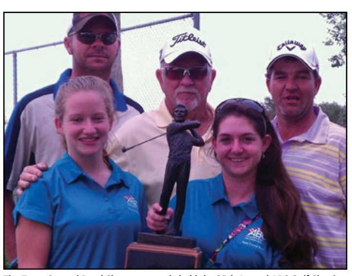
The Texas Coastal Bend Chapter recently held the 25th Annual ABC Golf Classic where 41 teams competed for top golf honors. The money raised from the tournament benefits the Craft Training Center and the Chapter's PAC.