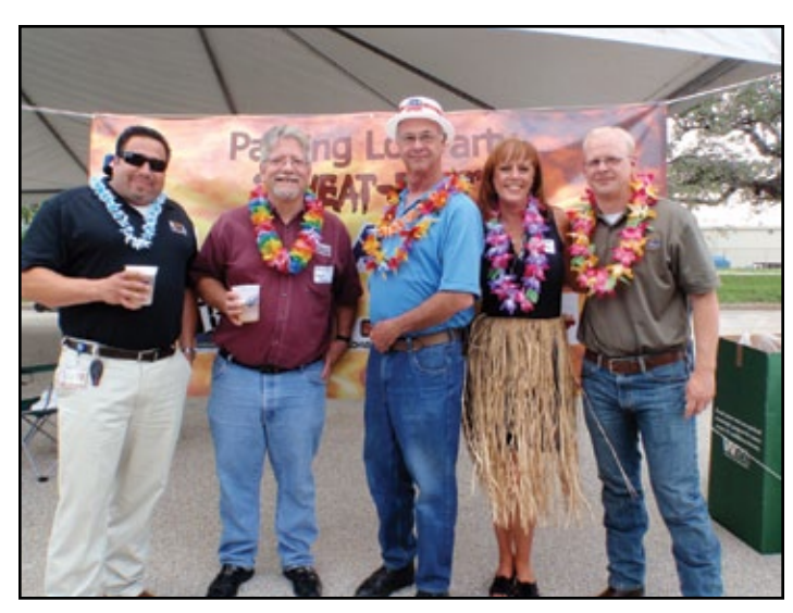
Over 300 construction industry members attended the annual Parking Lot Party hosted by the ABC South Texas Chapter, ASA, PHCC, ACCA, Virtual Builders Exchange and the Builders' Exchange of Texas this past May.

Award for Advocacy and Governmental Affairs Program Participation.