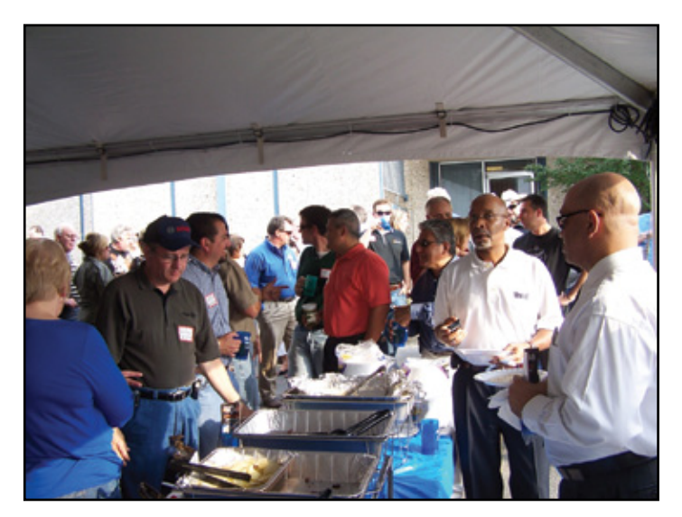
Over 350 industry representatives attended the annual ABC South Texas Chapter Parking Lot Party. This year's event was cosponsored by Associated Builders and Contractors (ABC), American Subcontractors Association (ASA), and the Virtual Builders Exchange (VBX).

trades, including Electrical, Engineering Graphics and Design, Instrument Fitter, Millwright, Safety, Health and Environmental Management, Scaffolding, and Construction Management.