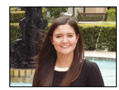
ABOUT THE AUTHOR:

Fabrication & Support Services 726 Highland Park Drive