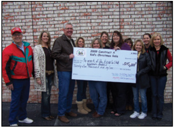
Members from ABC South Texas help collect toys, gifts and raise over $25,000 for the Annual Construct A Kid's Christmas Gala.

the transition from the military to civilian life.