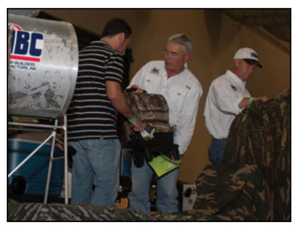
The ABC Southeast Texas Chapter's Outdoor Extravaganza drew approximately 2,400 people who visited with 101 booth participants.

On October 29th, ABC held its 16th annual Outdoor Extravaganza/ Member Trade Show. Approximately 2,400 people came out to Ford