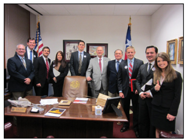
Members of ABC Greater Houston met with their Legislators during the 2013 ABC Legislative Day to discusses several bills that are of importance to the construction industry.

damages. Also in February, the committee met with the City's Development Services Department and SA Fire Department in an ongoing effort to improve the plan review, permitting and inspections processes. This has resulted in excellent lines of communication between all parties. On the horizon locally are the upcoming SA City Council elections.