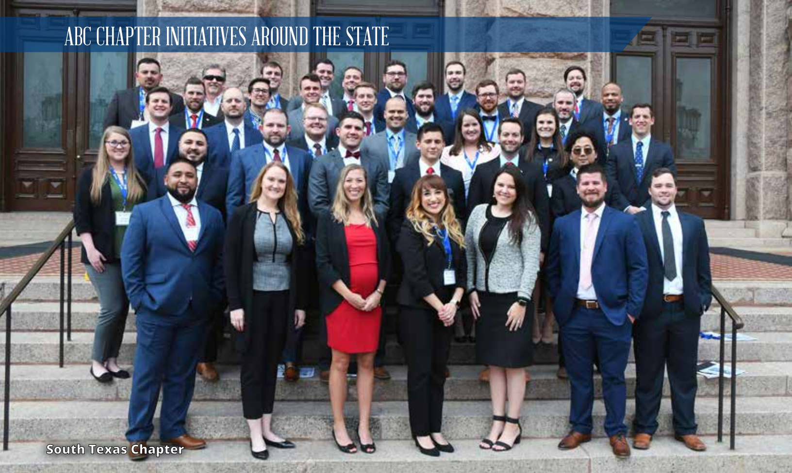
South Texas Chapter

Legislative Days events February 5th and 6th. Several members of the Emerging Leaders Group participated in the Young Professionals Seminar and many more attended the PAC dinner and Legislative Day breakfast and Capitol visits the next day.