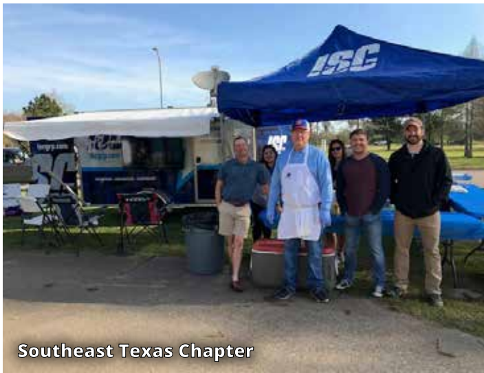
Southeast Texas Chapter

On the fun side of life, the chapter modified a couple of events, added a new event, and expanded an existing event. In February the first annual Texas Hold 'Em tournament had 100 die hard players and an incredible ending. In March, there was the annual Chili Cook off with 29 teams featuring some outstanding chili. In April, the annual Spring Golf Tournament and Annual Casino Mixer were combined. This year it was a four man, nine hole scramble, followed by a casino mixer. Over 22 teams competed with first and second place winners on the front nine and back nine. This shorter format allowed everyone to join those not interested in golf at one of the casino game tables.