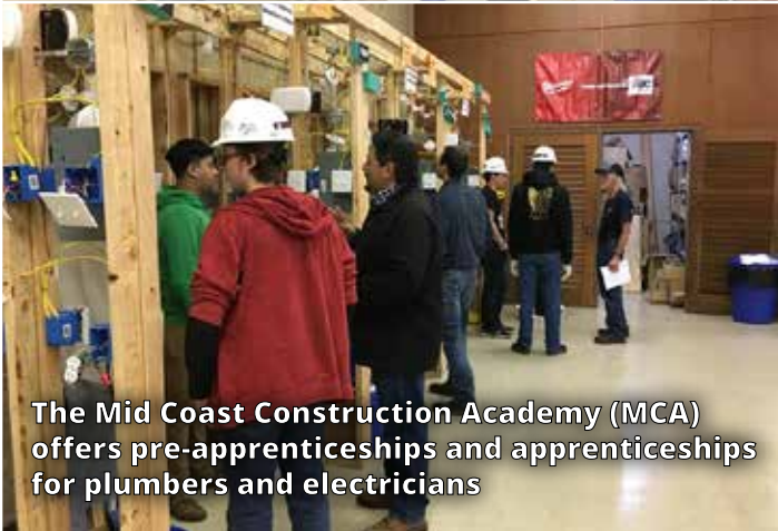
The Mid Coast Construction Academy (MCA) offers pre-apprenticeships and apprenticeships for plumbers and electricians

The ABC Texas Mid Coast Chapter is in recruiting mode for the upcoming school year for the Mid Coast Construction Academy (MCA). The program offers pre-apprenticeships and apprenticeships for plumbers and electricians and so far, it appears that the MCA will receive double the number of applicants seeking a seat in the classes that began in August 2019. Much of the success of the program can be attributed to: student peer recruitment, career fair participation, school presentations and employer recruitment.