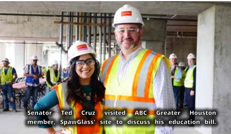
Senator Ted Cruz visited ABC Greater Houston member, SpawGlass' site to discuss his education bill.