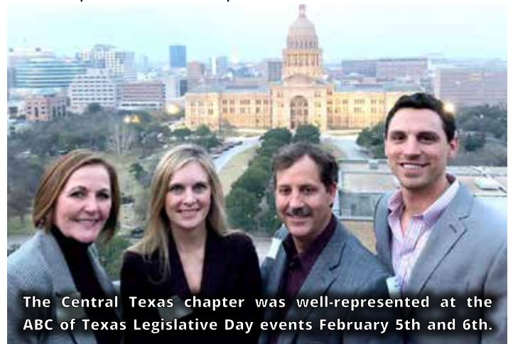
The Central Texas chapter was well-represented at the ABC of Texas Legislative Day events February 5th and 6th.

The chapter was well-represented at the ABC of Texas