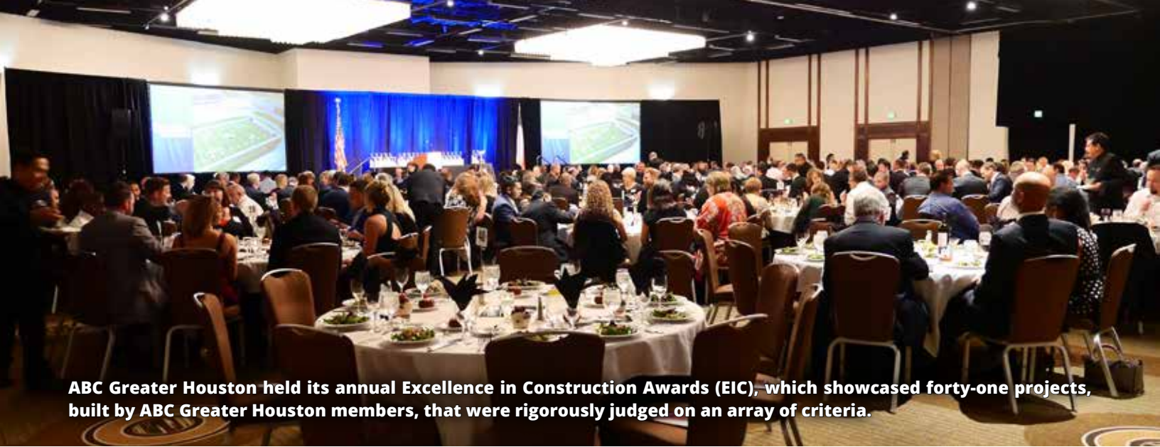
ABC Greater Houston held its annual Excellence in Construction Awards (EIC), which showcased forty-one projects, built by ABC Greater Houston members, that were rigorously judged on an array of criteria.

Harvey severely impacted the Texas Gulf Coast with multiple landfalls August 25-29 and many families are still recovering. In times like these we are often able to see not only the worst, but the best of things. We experienced neighbors helping neighbors, and our good friends at Alliance Safety Council in Baton Rouge were quick to respond with help. We are grateful for their support and for the support from many others during this difficult time.