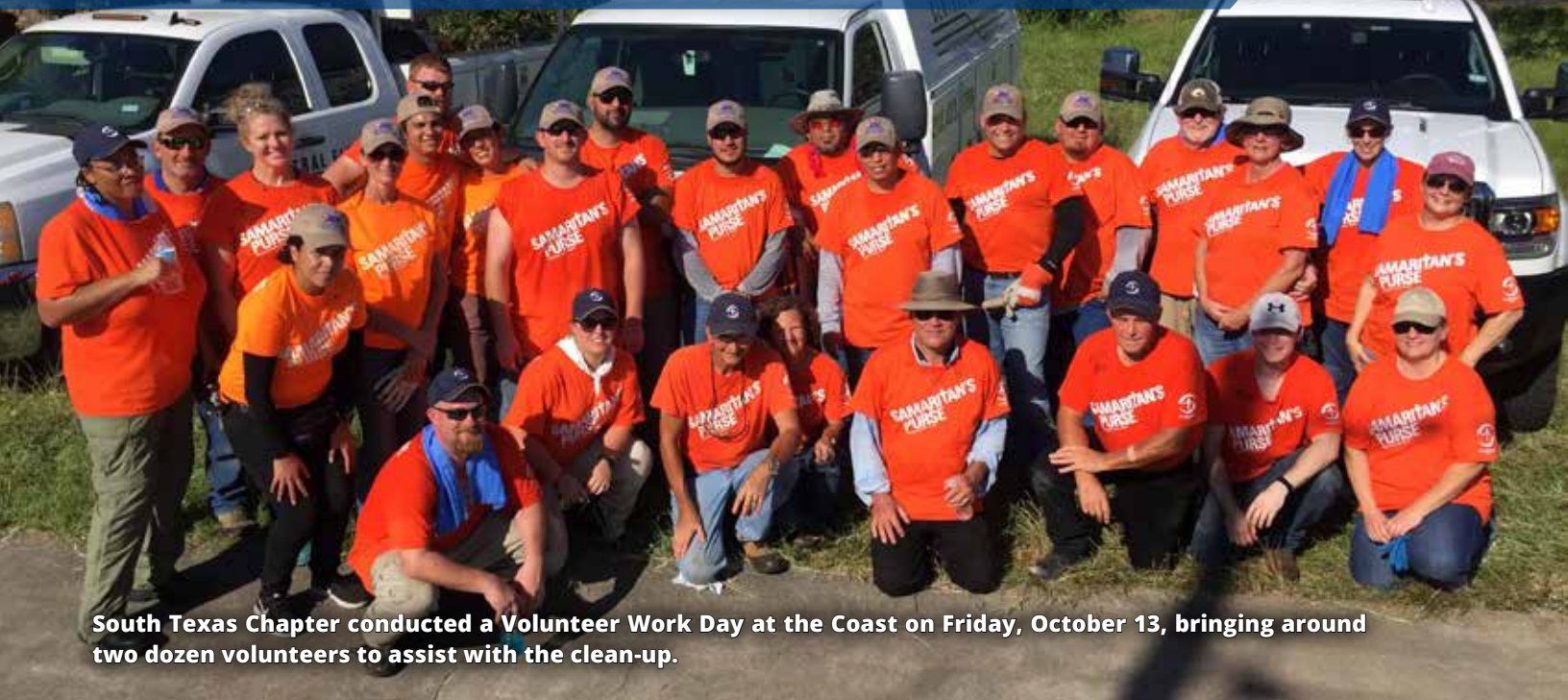
South Texas Chapter conducted a Volunteer Work Day at the Coast on Friday, October 13, bringing around two dozen volunteers to assist with the clean-up.