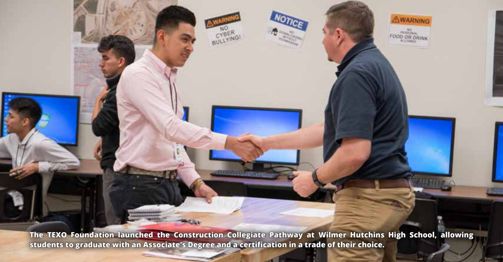
The TEXO Foundation launched the Construction Collegiate Pathway at Wilmer Hutchins High School, allowing students to graduate with an Associate's Degree and a certification in a trade of their choice.

volunteered to help with evacuations, food, clothing and shelter, and also aided customers with repairs and restorations, even in the midst of dealing with their own personal losses.