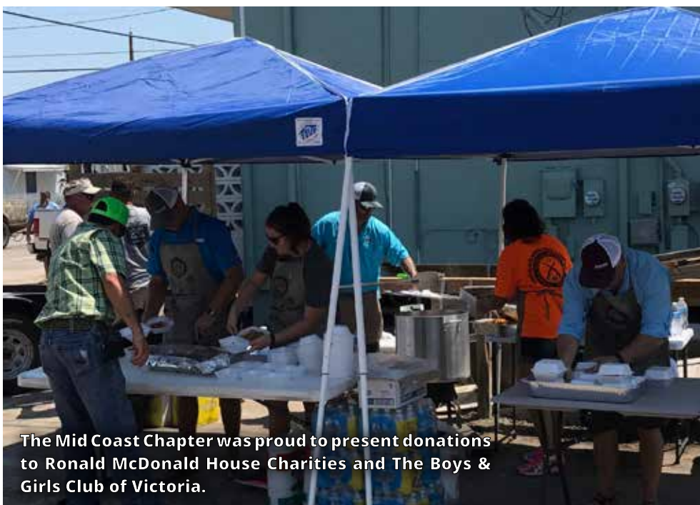
The Mid Coast Chapter was proud to present donations to Ronald McDonald House Charities and The Boys & Girls Club of Victoria.

• The ABC Texas Mid Coast Chapter is proud to support the commercial and industrial construction industries in Bee, Calhoun, DeWitt, Goliad, Jackson, Lavaca, Refugio and Victoria Counties.