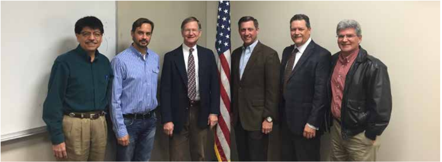
The South Texas chapter held a “coffee break” with ABC’s good friend Congressman Lamar Smith.

career & technology students from the area were bussed in. This event was a great opportunity to educate the future workforce about various career paths and the availability of good entry-level jobs in Southeast Texas. The students also attended interviewing workshops throughout the day designed to help hone their job-readiness skills. The Construction Training Center was able to set-up one of its “Welding Simulators” in the exhibit booth, and demonstrated to the students and teachers virtual simulations of the sights, sounds and dexterity of being a Welder; this piece of equipment was a huge hit with everyone!