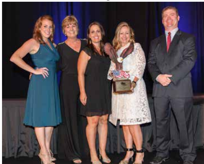
The best projects in Central Texas were honored at the Excellence in Construction Banquet.

2015 has been a year of collaboration for the chapter. In November, ABC and AGC came together for a common cause – to