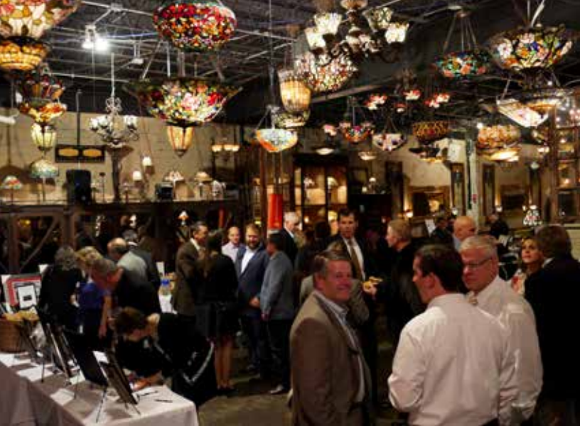
Greater Houston Chapter celebrated their PAC Christmas Party at Nouveau Art Bar.