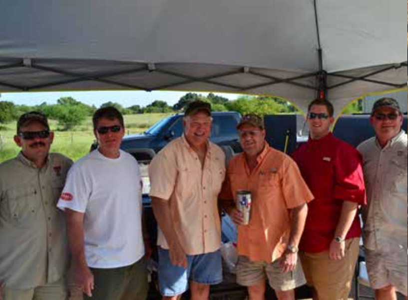
Texas Mid Coast Chapter's Annual Dove Hunt was held at the Hartman Family Ranch.