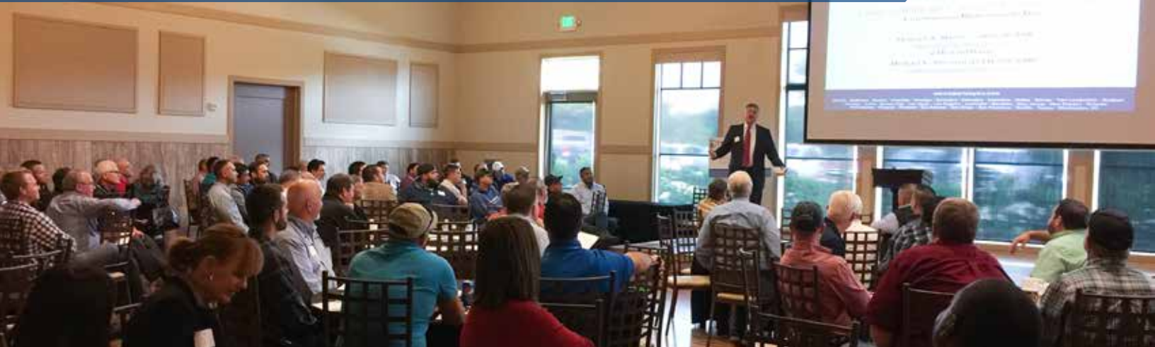
TEXO Hosts First Annual Construction Safety Professionals Day for more than 250 safety professionals and industry peers.