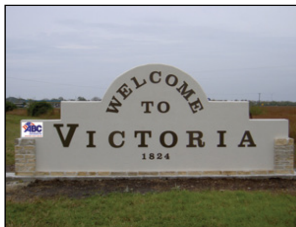
The ABC Mid Coast Chapter partnered with the Keep Victoria Beautiful organization to build a new entry sign at the intersection of US Highway 59 and State Highway 185 North.