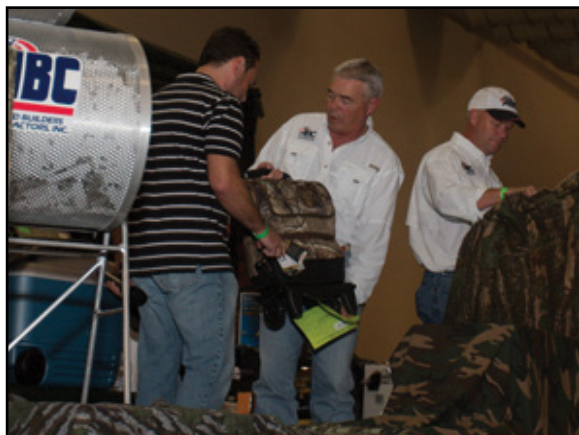
The ABC Southeast Texas Chapter's Outdoor Extravaganza drew approximately 2,400 people who visited with 101 booth participants.

On October 29th, ABC held its 16th annual Outdoor Extravaganza/Member Trade Show. Approximately 2,400 people came out to Ford