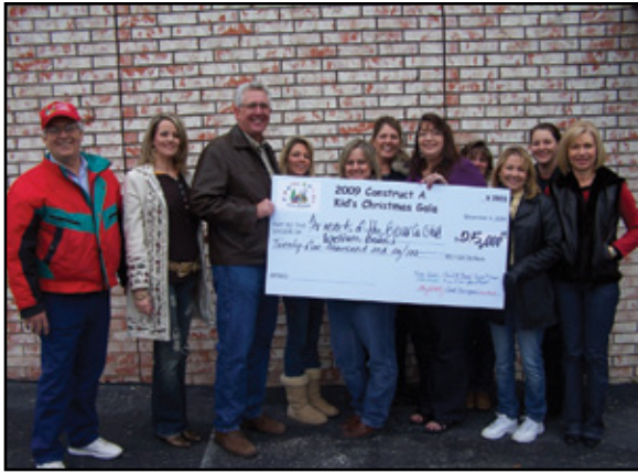
Members from ABC South Texas help collect toys, gifts and raise over $25,000 for the Annual Construct A Kid's Christmas Gala.

the transition from the military to civilian life.